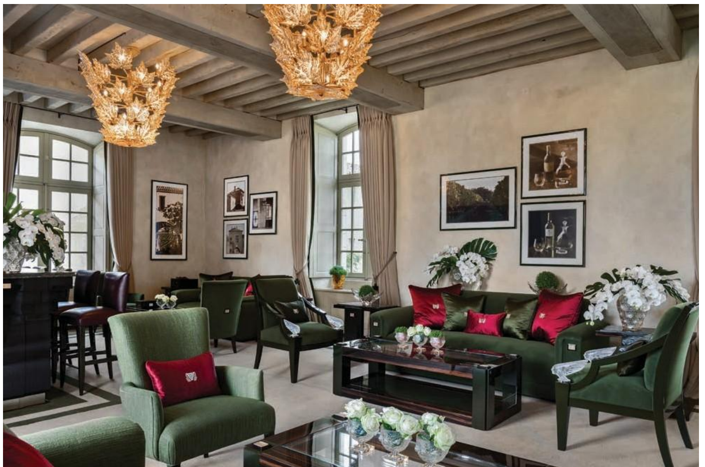
© Agi Simas & Reto Guntli